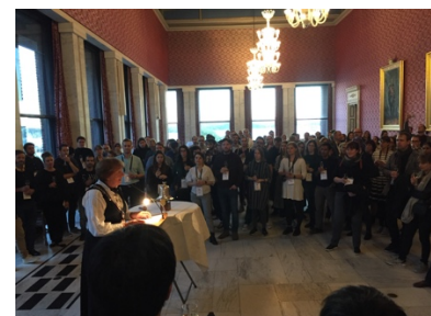
Town hall reception with the Mayor